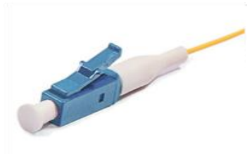
Single mode LC/UPC pigtail