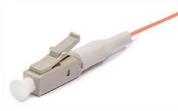
Multimode LC/UPC pigtail